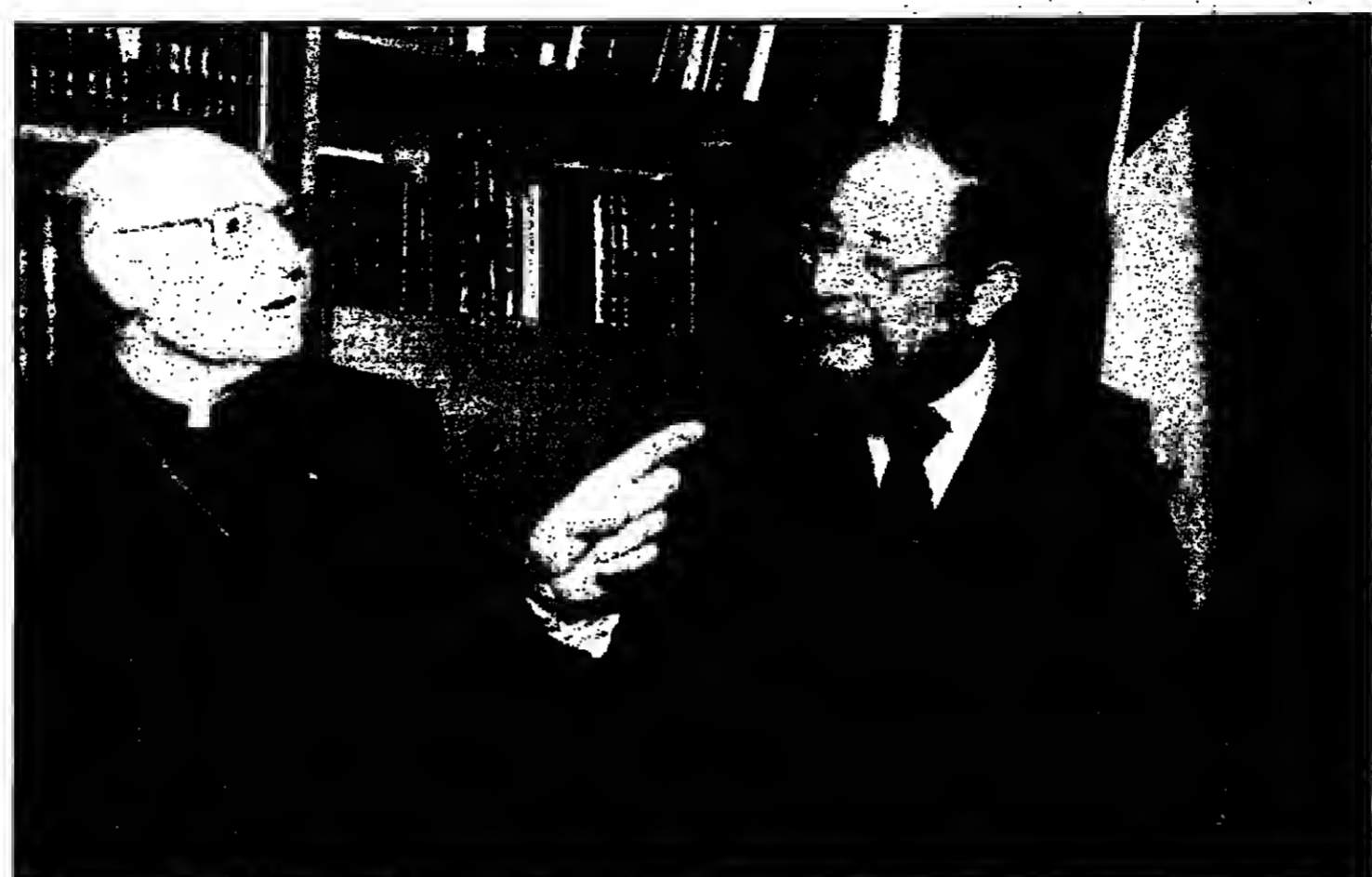
Cardinal Edward Cassidy, head of the Vatican's Commission for Religious Relations with the Jews, gestures during a meeting yesterday with Ashkenazi Chief Rabbi Yisrael Lau at Hechal Shlomo in Jerusalem. Pope John Paul II definitely plans to visit here by the end of 1999, Cassidy said. Until now, Vatican-watchers had assumed that the pope would make a pilgrimage here during the year 2000, to mark the second millennium of Christianity.